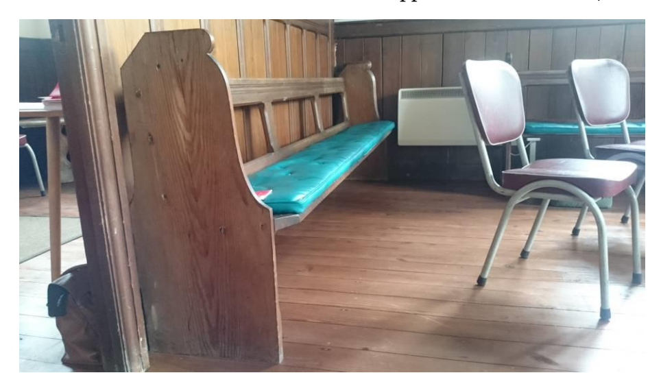
Figure 3: Historic benches in meeting room

The main meeting room contains historic pine benches (Fig.3) that were originally arranged to face the ministers' stand, are now arranged in a square. The loose modern chairs are arranged in a circle around a central oak table which appears to date from c1700.