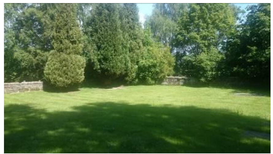
Figure 5: Whitley Burial Ground

Whitley Burial Ground (Fig.5.) is located on the road between Lower Whitley on the south and Higher Whitley on the North. The National Grid Reference is SJ 61642 79691. The 618 square yard site has red sandstone walling listed at Grade II. The date of the earliest gravestone is 1686 for John Starkey; unusually for Quakers this gravestone is decorated with a shield engraved with scrolls to both side and a bird within the centre of the shield.