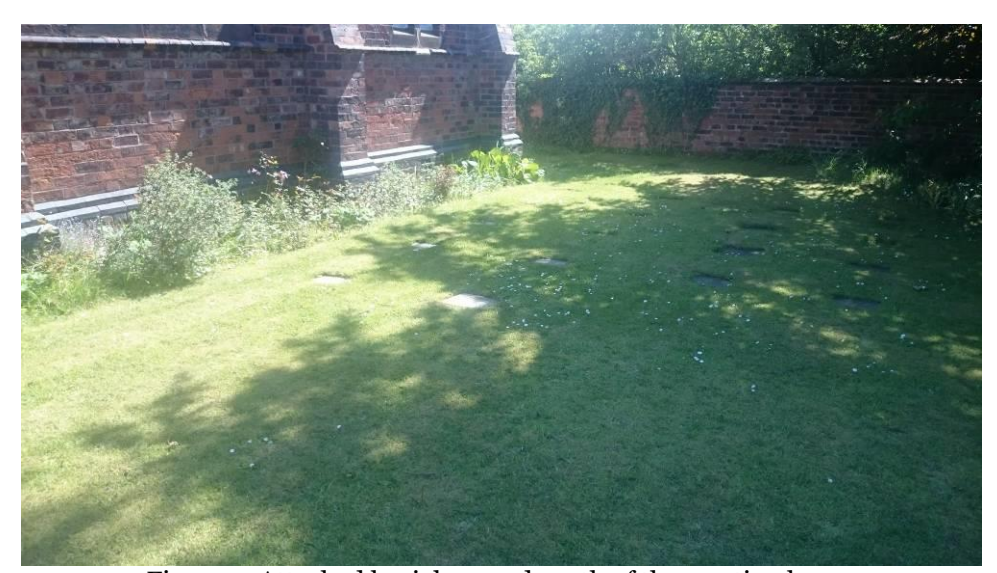
Figure 4: Attached burial ground south of the meeting house

The burial ground lies to the south (Fig.4.) of the meeting house. Burials took place between 1713 and 1782 and for cremations between 1957 and 2014. Whilst the burial ground is no longer accepting future burial of ashes, the detached burial ground at Whitley is still open. There are no headstones for the burials, only flat headstones that mark the positions of cremations. Older burial records are deposited at the Cheshire Records Office.